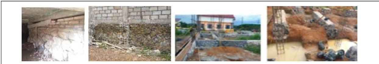
Figure 8: Foundation of Amuntai Area