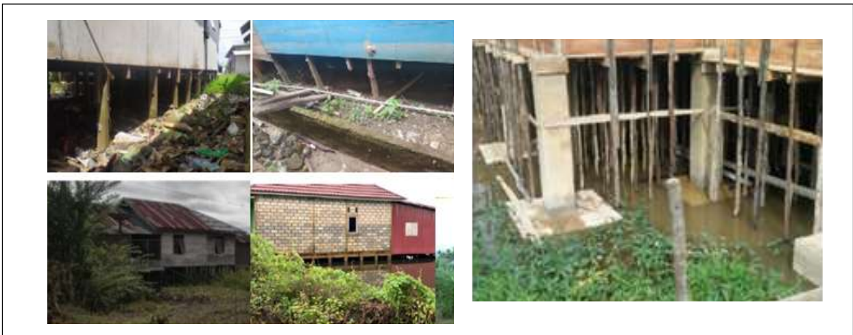
Figure 12: Foundation of Kotabaru, Kandangan, and Amuntai Area