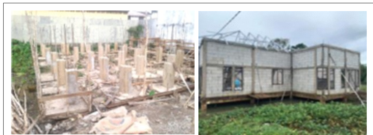
Figure 5: Concrete Foundation