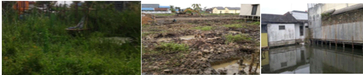
Figure 1: Land Condition in Banjarmasin

Soil conditions in Banjarmasin which are mostly swamp land (wetlands) have different conditions between one land plot and another (Nurfansyah et al. , 2020), the general conditions are dry soil (overgrown with plants/grass), slightly wet or slightly dry marked by the presence of water during foundation excavation, and soil with high water (fully submerged in water) as shown in Figure 1.