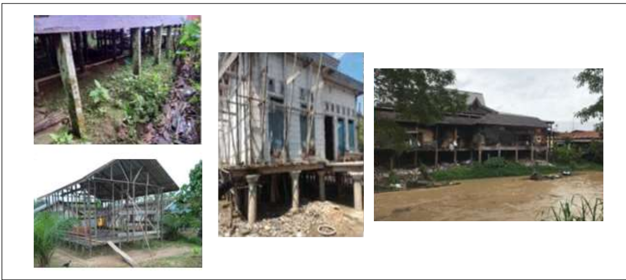
Figure 13: Foundation of Kotabaru, Kandangan, and Amuntai Area