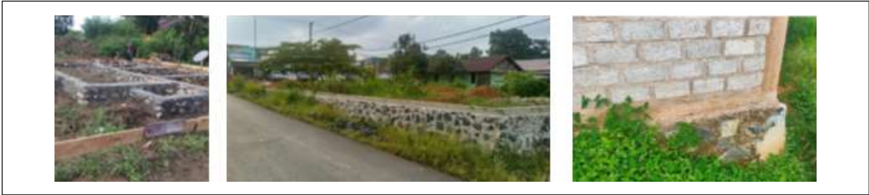
Figure 6: Foundation of Banjarbaru and Banjar Region