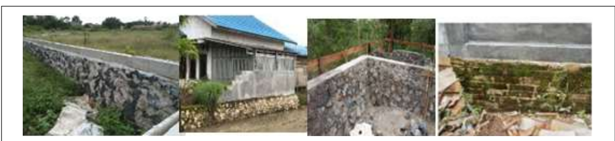
Figure 10: Foundation of Balangan and Kotabaru Area