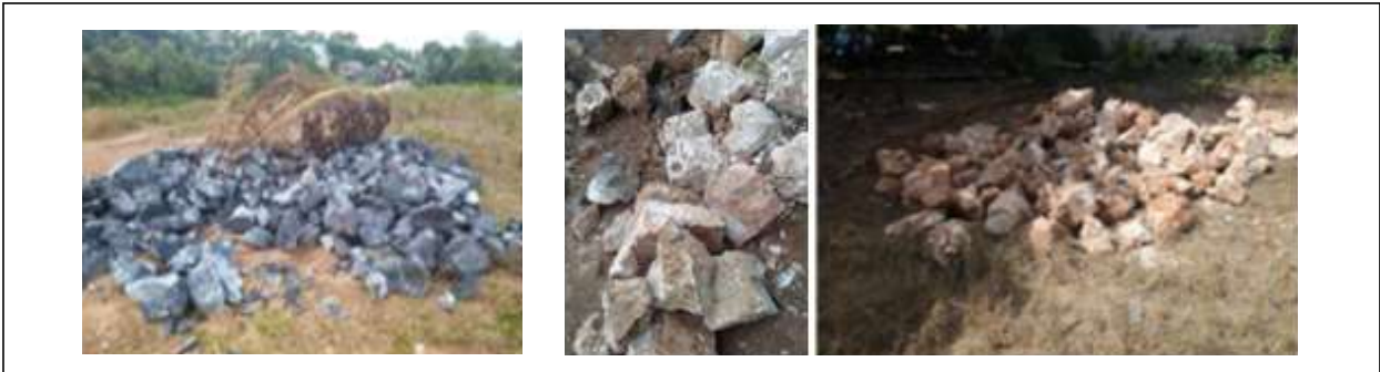
Figure 11: Rock and Limestone Foundation Material

For watery land conditions, pile foundations were found, either wooden piles or concrete piles. Picture. Foundations for Tanah Bumbu, Kotabaru, Kandangan, Amuntai, and Tabalong Areas In some areas, concrete foundations are used even though the land is dry and watery (Figures 7 to 13).