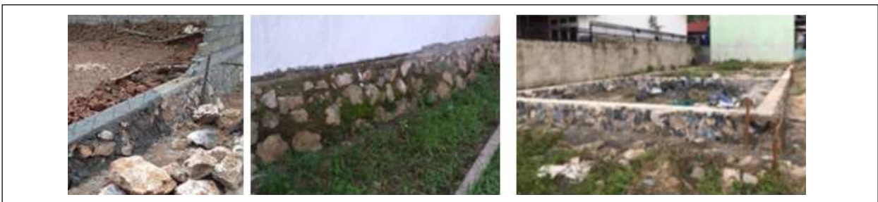
Figure 9: Foundation of Tabalong and Tapin Area