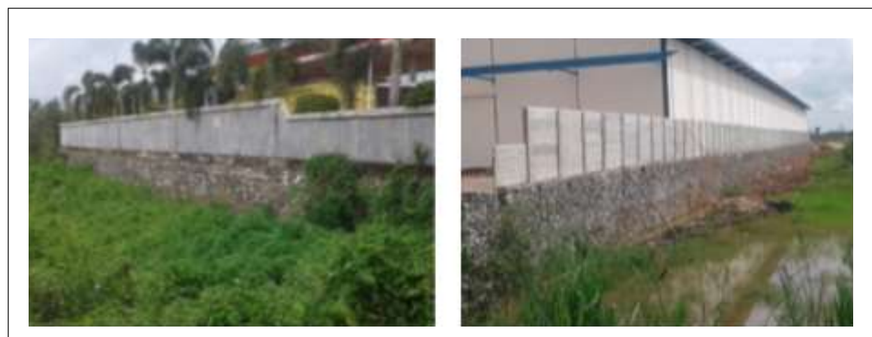
Figure 14: Use of Foundation on Soft Soil

The method of implementing stone foundations in dry conditions should take into account the condition of the water surface which can change so that it can affect the bearing capacity of the soil from dry with strong bearing capacity to watery conditions with weak bearing capacity.