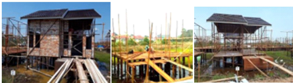
Figure 2: Frame Construction House

To support this condition, poles are used to support the building of the house. The house is in the form of wooden poles using ironwood material (Figure 2). At the top, after the wooden pillars, a frame construction is used which is usually also made of ironwood material. For infilling/covering walls, bricks are used which are installed standing up, in order to keep the building load lighter. This standing masonry is also suitable for filling walls which are generally constructed of wood frames as well. The wooden frame of this wall is a row of poles that are installed along the wall at a distance of 1 (one) meter.