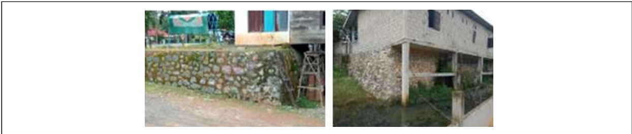
Figure 7: Foundation of Ground Spice Area