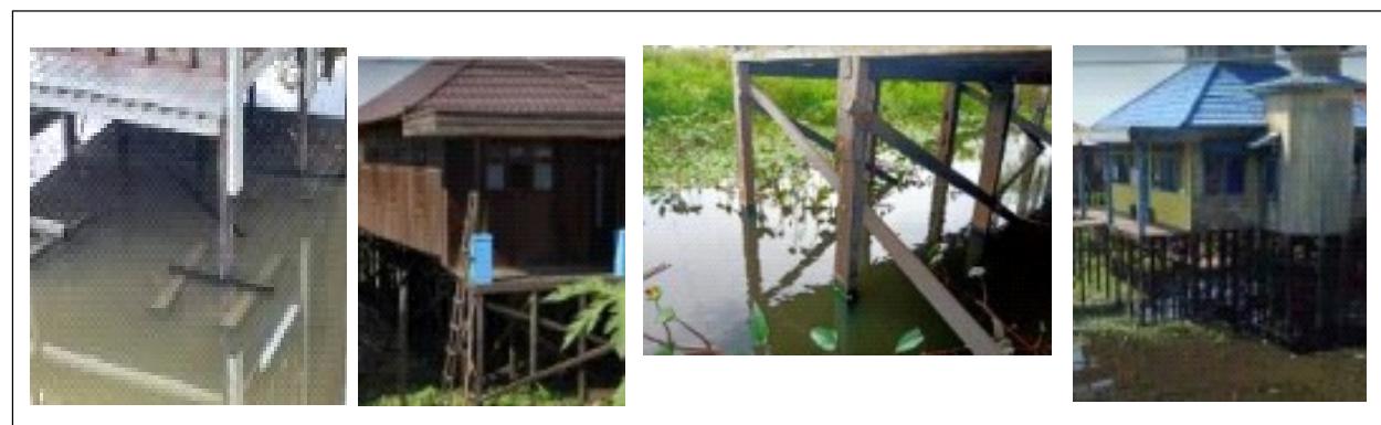
Figure 4: Wooden Pile Foundation

From the survey results/field observations, it was found that the types of foundations in Banjarmasin are generally divided according to the material of the building supports, namely wooden pile foundations and concrete pile foundations (Figures 4 and 5). For small loads such as buildings (houses) of the semi-permanent type, wooden pile foundations are generally used. As for large loads such as permanent/modern buildings, concrete pile foundations are used.